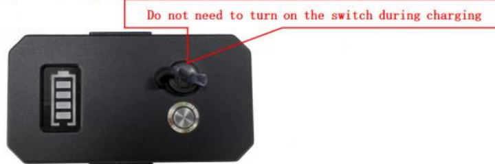
Rear View of the Device Main Unit

The battery has a charging port on the side. After connecting it to the included charger, you can charge the battery.