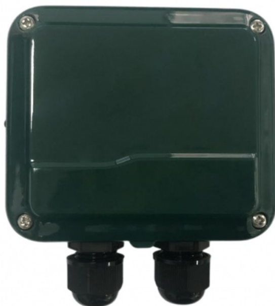
DP200Z-1 Microwave Radar Vibration Intrusion Detection Master Unit