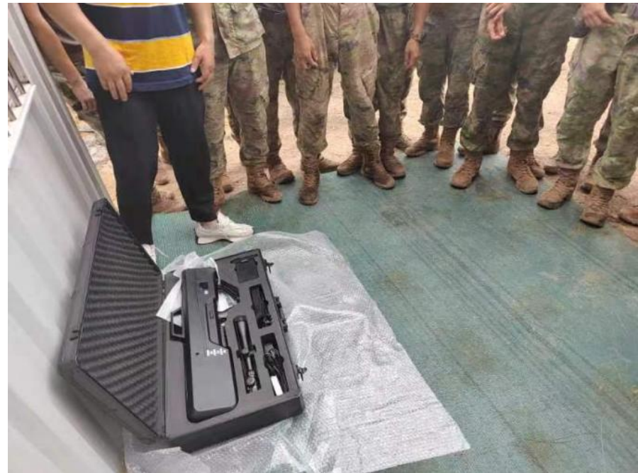
6, Paking and Delivery